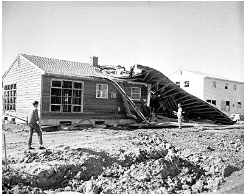
Tornado damage in Palatine from the 1959 Tornado.

Long Grove was also hit by one of the June 3, 1860 tornados. This outbreak was one of the 25 worst in US History, killing more than 100 people. Not much is known about the impact in Long Grove, aside from a few references to damage being reported.